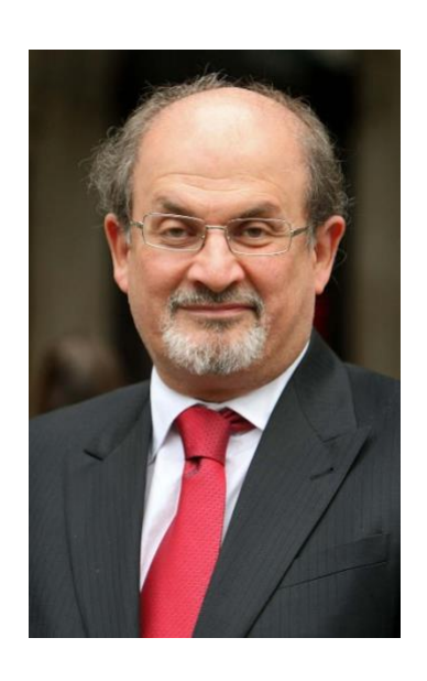
With fatwa, with weapons

On Friday, August 12, the bloody attack on Salman Rushdie shocked and saddened the world. Rushdie was Salman seriously injured in this attack. This tragic event, as an attack on the freedom of expression, was met with a wide reaction and condemnations all around the world. However, most of the government-affiliated media happily defended Khomeini's brutal and medieval fatwa and they praised the assailant.